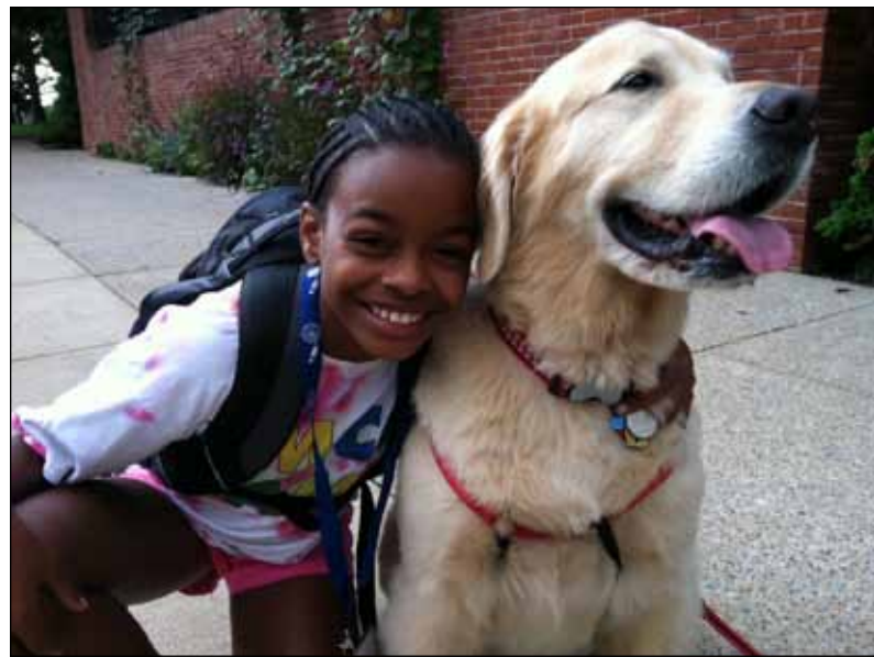
A camper hangs out with Brealey, our "therapeutic dog"