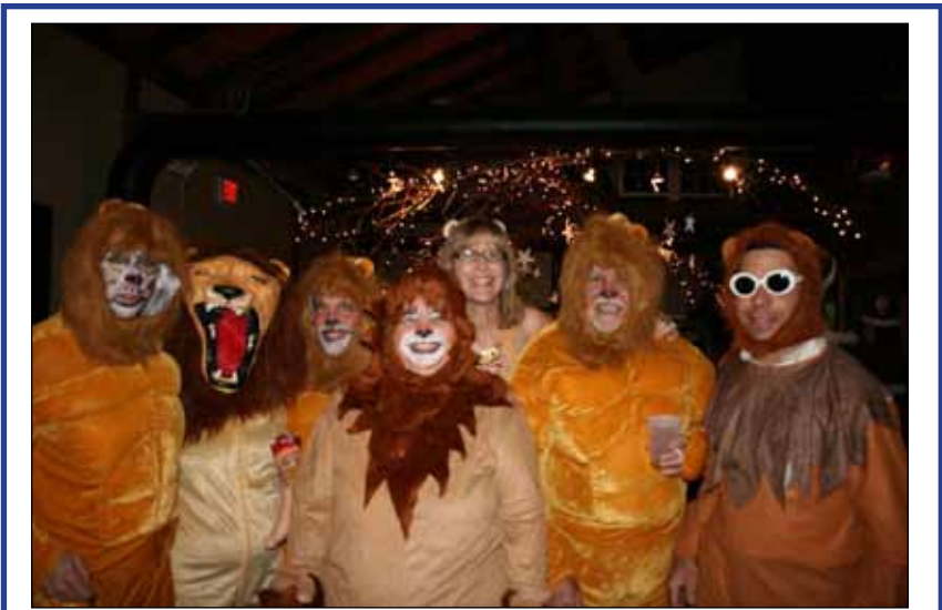
Members of the Kennett Lions Club Morning Branch at the Fright Feast Event. The event raised over $10,000 for Camp Dreamcatcher and Canine Partners for Life