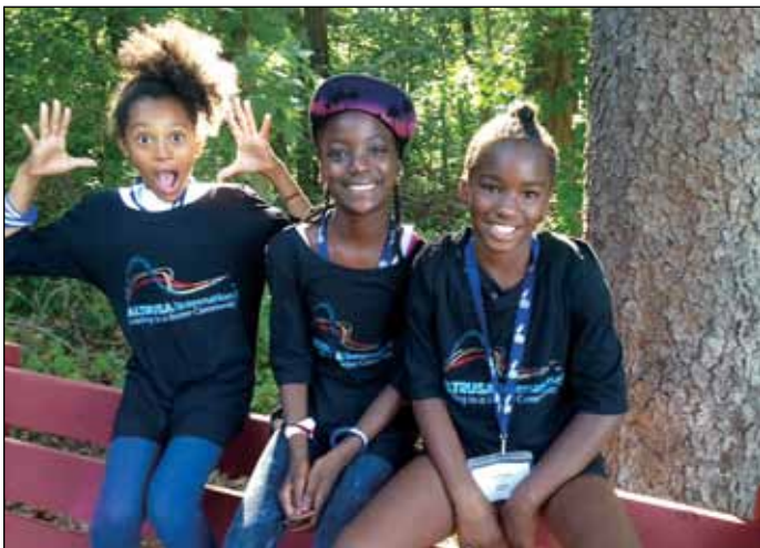
Thank you for supporting Camp Dreamcatcher!