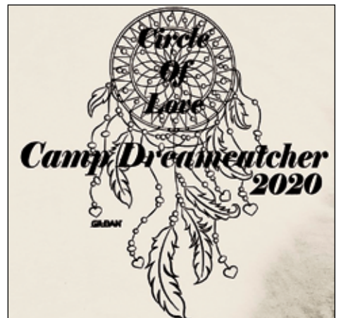
Camp Dreamcatcher 2020 T-Shirt