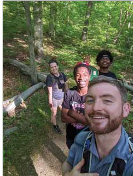
Camp Dreamcatcher Virtual 5K & 1 Mile Run/ Walk