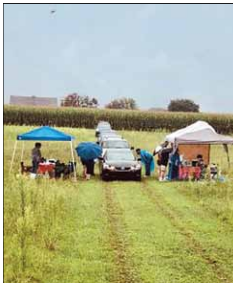
COVID-19 Testing at Camp