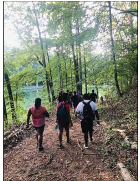
Wilderness Program Hike